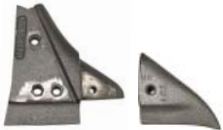
RH 250 A RH 251